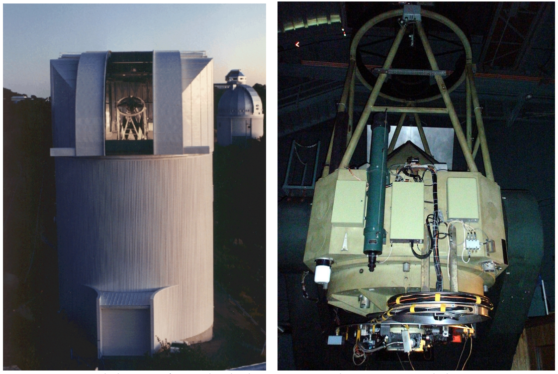
Figure 6 – Steward Observatory's 90-inch Bok telescope on Kitt Peak.

Catalina Sky Survey has also commissioned operations on the 2.3-m Bok survey telescope on Kitt Peak, in partnership with Spacewatch and the University of Minnesota. This collaboration (MPC code V00) has been awarded several nights per month for a deep survey near-sun in the evening and morning hours and for drilling deep into opposition during the darkest hours of the night. The larger aperture has already demonstrated its value in the discovery of a large and nearby Potentially Hazardous Asteroid during engineering for the new facility.