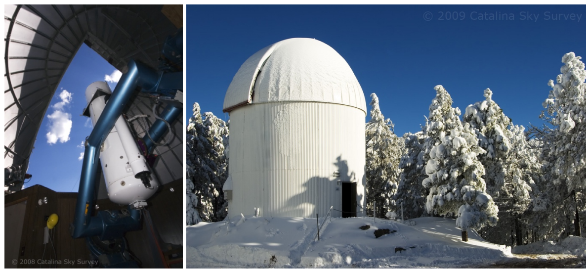
Figure 1 – The Catalina Sky Survey Schmidt telescope on Mount Bigelow, MPC code 703. This is the configuration of the telescope when configured with its 4K CCD camera.

The original Catalina Sky Survey used an earlier configuration of the Mount Bigelow Schmidt telescope. These photographic data are not (currently) considered for archiving in the PDS Small Bodies Node. Modern CSS operations began with the Schmidt in its current configuration of a 0.7-m primary and full-aperture corrector. This is a rather thick corrector and CSS has been funded to evaluate an upgrade to the optics of this telescope. If so, this would likely result in a new telescope and instrument context for PDS.