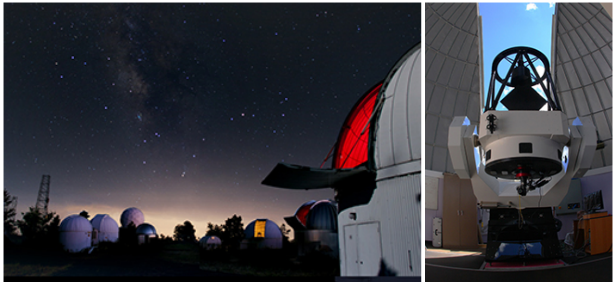
Figure 7 – Mount Lemmon SkyCenter and the 0.8-m Schulman telescope.

CSS is always looking for access to new, or new-to-us, telescopes. In the near future this will include the 0.8-m Schulman telescope of the Mount Lemmon SkyCenter<sup>2</sup>, which is MPC code G84 when used for astrometric follow-up. We have been funded by NASA to provide a new camera and will receive a significant amount of telescope time in return. The Schulman will be used for astrometric follow-up to offload brighter objects from Catalina Sky Survey's nearby 1.0-m I52.