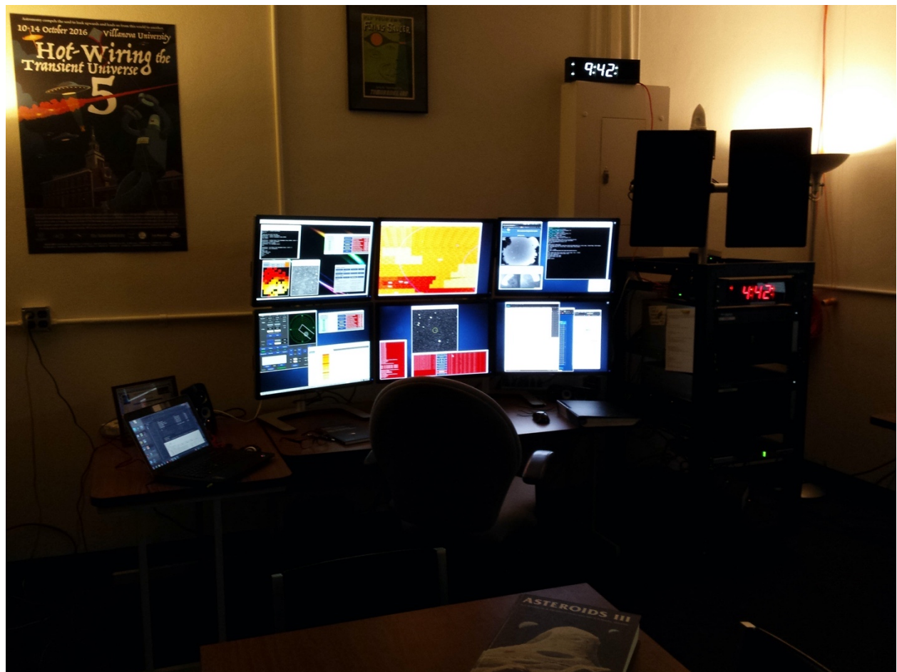
Figure 4 – CSS remote observing console at the Lunar and Planetary Laboratory on the campus of the University of Arizona in Tucson. This is a frequent station for the observer for Catalina's 1-m follow-up telescope, I52.

Catalina Sky Survey realized a significant addition to its NEO discovery capabilities with the commissioning of the 1.0-m astrometric follow-up telescope on Mount Lemmon, MPC code I52. By offloading same-night and subsequent follow-up responsibilities from the survey telescopes, these are freed to generate even more candidate NEOs for follow-up. The combination of I52 and later V06 (below) have become the most productive follow-up telescopes for NEOCP follow-up and arc extensions. A major prime focus upgrade to I52 is nearing completion. I52 was also the first CSS telescope to be operated fully remotely from the University of Arizona campus as well as from the control room of our other telescopes, and has served as the pilot for such capabilities to remotely operate our other telescopes, including from our observers' homes during the COVID pandemic.