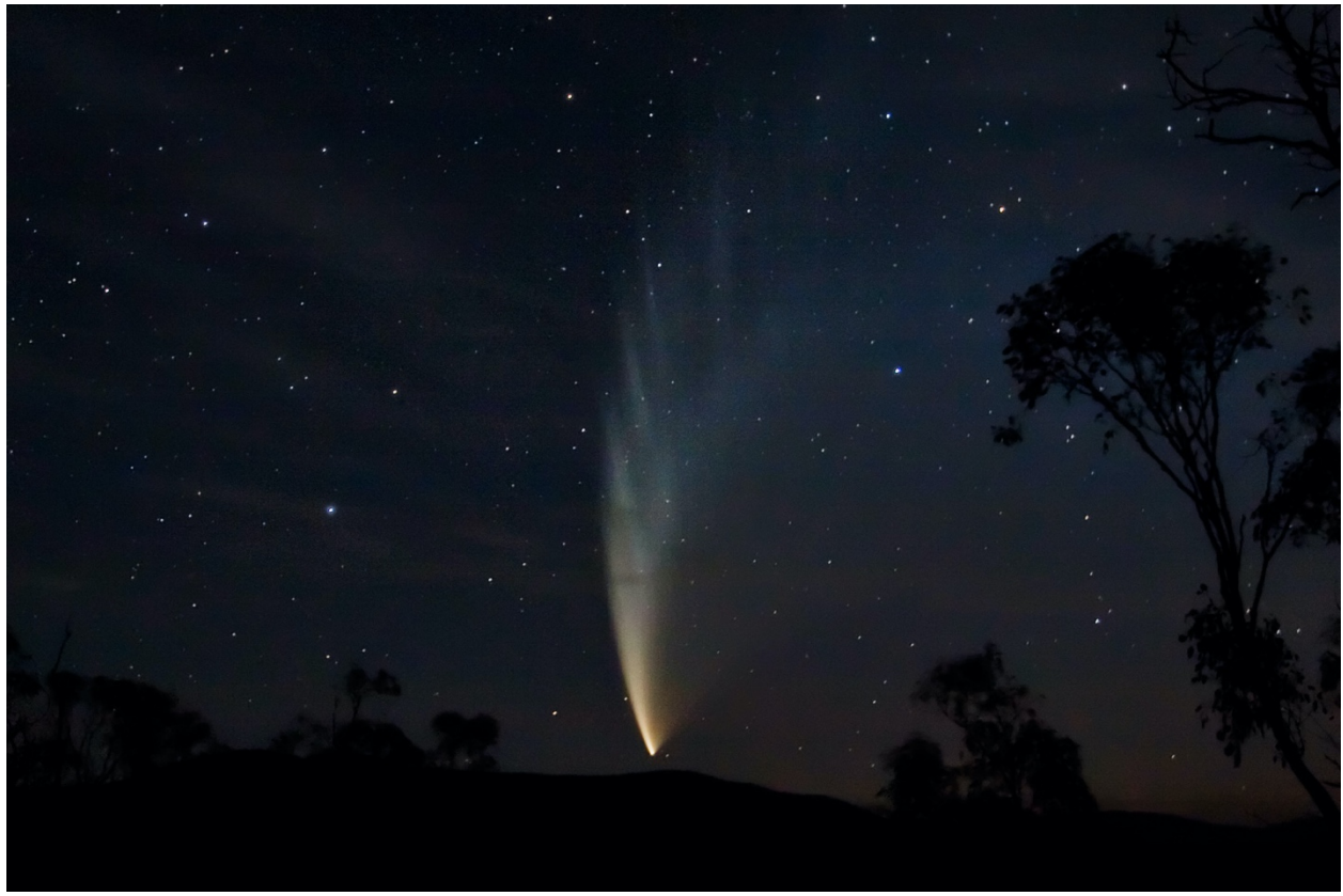
Figure 3 – Comet C/2006 P1 McNaught; photo taken from Swifts Creek, Victoria, Australia at 3pprox.. 10:10PM. Taken at f/4, ISO 800, 20 seconds and ~24 mm with post-processing in Photoshop to bring out details.

From 2003 to 2013 Catalina Sky Survey operated the only major NEO survey telescope in the southern hemisphere in partnership with the Australian National University using the 0.5-m Uppsala Schmidt telescope at Siding Spring Observatory in New South Wales, Australia. The Siding Spring Survey operated under MPC code E12 and is credited with discovering 467 Near-Earth Asteroids as well as many comets, including Comet McNaught, the "Great Comet of 2007" (see figure 1).