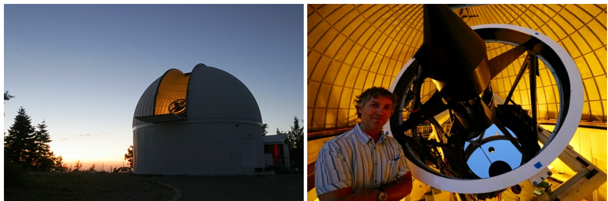
Figure 2 – The 1.5-m Catalina Sky Survey telescope on Mount Lemmon, MPC code G96.

The Catalina Sky Survey 60-inch survey telescope on Mount Lemmon, MPC code G96, has been a significant contributor to the annual Near-Earth Object discovery statistics since 2005 and is again leading the NEO discovery total in 2020. Indeed, as of 2020, G96 is the most prolific single telescope in the grand total of NEOs discovered (7,814) and NEO observations (178,966), as well as of incidental observations of asteroids of all kinds (45,715,932).