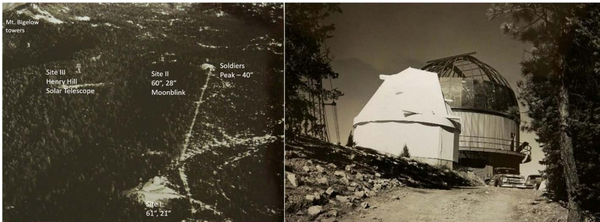
Figure 1 – Historical Mount Bigelow Station. Left: A wide array of instruments dotted Mt Bigelow in 1968. Right: Approach road to the 61-inch and 21-inch telescopes under construction.

The first telescope in the Catalina Mountains was built in 1962 for polarimetry and photometry at the site of the current 0.7-m Schmidt telescope adjacent to Mount Bigelow. The telescope that would become the Catalina Sky Survey 1.5-m was built at the direction of University of Arizona planetary scientist Gerard Kuiper in 1967. At the time, it was slewed by hand. IBM punch cards and star charts were used to locate targets, and data was recorded on paper tape. The 1.0-m telescope was built in 1968 to test if a center-supported glass mirror would produce quality images.