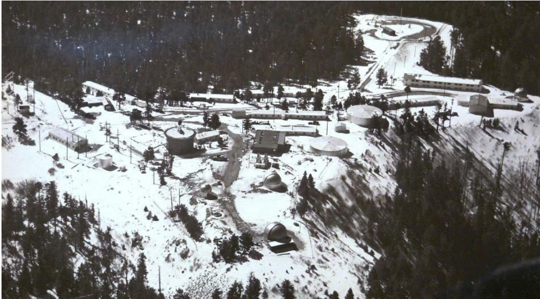
Figure 2 – Mount Lemmon Station in 1971. What is now the CSS 1.5m telescope is located at bottom center.

In 1970 the U. S. Air Force closed their radar station at the summit of Mt. Lemmon and Kuiper petitioned the U. S. Forest Service to take over the site for a new observatory. This would become the future home of the 1.5-m and 1.0-m Catalina Sky Survey telescopes which were moved there in 1971.