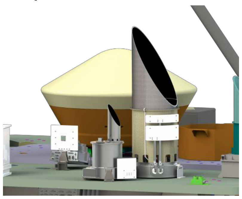
Figure 1. OCAMS Camera Suite.

sample site flyover sorties provide centimeter and sub-centimeter scale Polycam images to provide both context and confirmation of TAGSAM (Touch And Go Sample Acquisition Mechanism) ingestible material. The final sampling sequence is documented by the widefield SamCam and gives the context for the recovered sample. All cameras use identical detector arrays with different focal lengths separated by a factor of 5. The 3 cameras in the instrument suite provide overlapping capabilities and are functionally redundant. [Smith et al. 2013, Rizk et al. 2018].