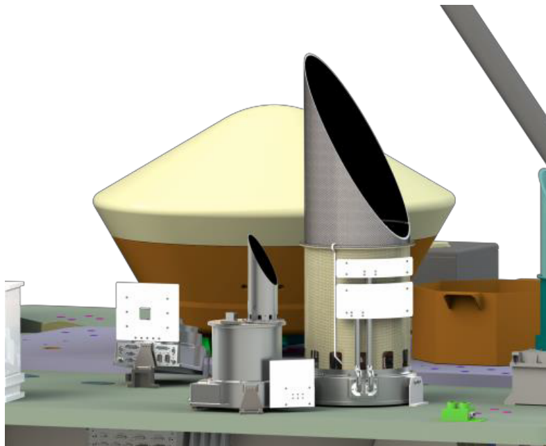
Figure 1. OCAMS Camera Suite.

sample site flyover sorties provide centimeter and sub-centimeter scale Polycam images to provide both context and confirmation of TAGSAM (Touch And Go Sample Acquisition Mechanism) ingestible material. The final sampling sequence is documented by the wide-field SamCam and gives the context for the recovered sample. All cameras use identical detector arrays with different focal lengths separated by a factor of 5. The 3 cameras in the instrument suite provide overlapping capabilities and are functionally redundant. [Smith et al. 2013, Rizk et al. 2018].